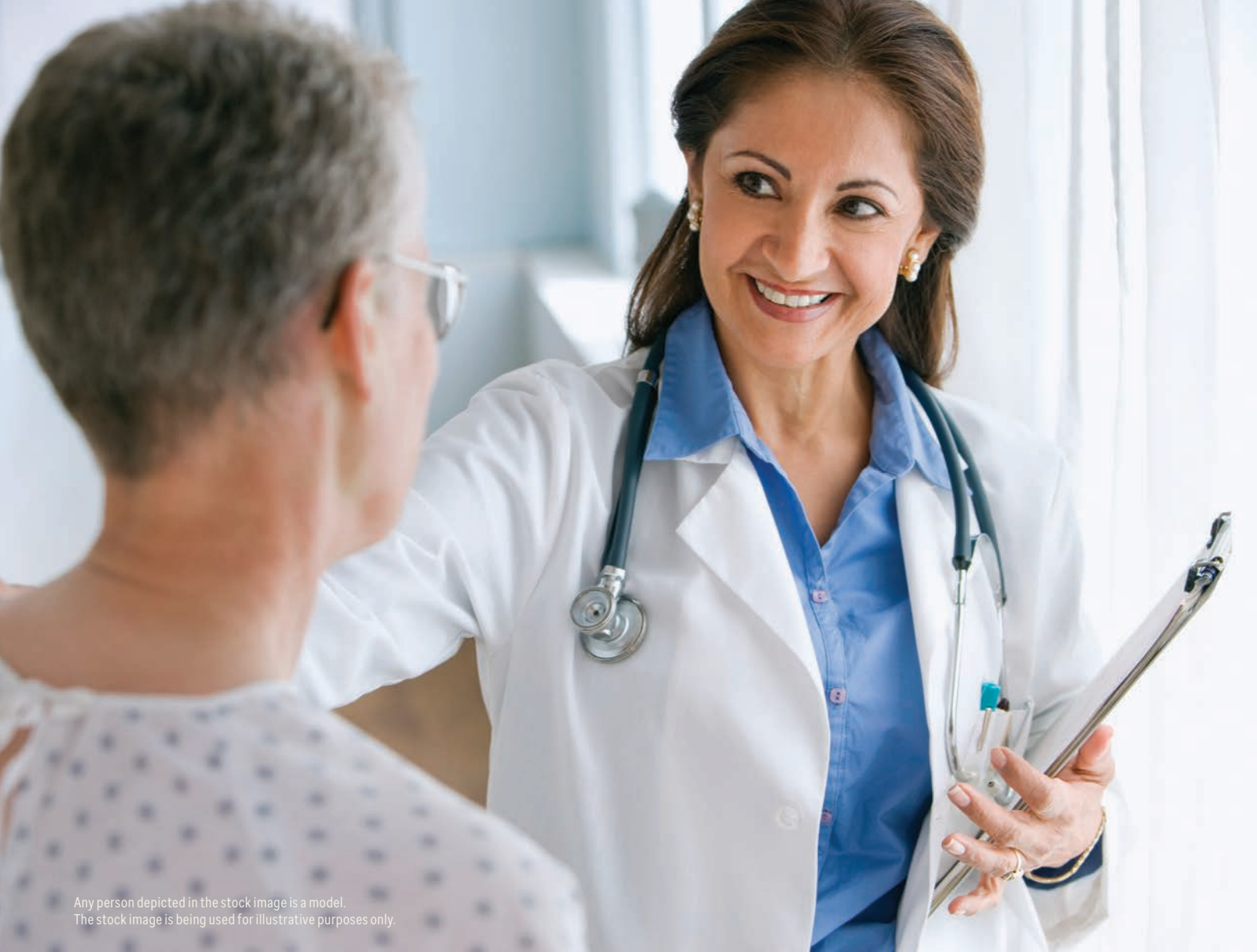
Any person depicted in the stock image is a model. The stock image is being used for illustrative purposes only.